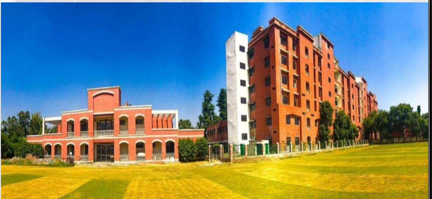
SPORTS COMPLEX AND NEW TEACHING BUILDING: A VIEW FROM SPORTS GROUND